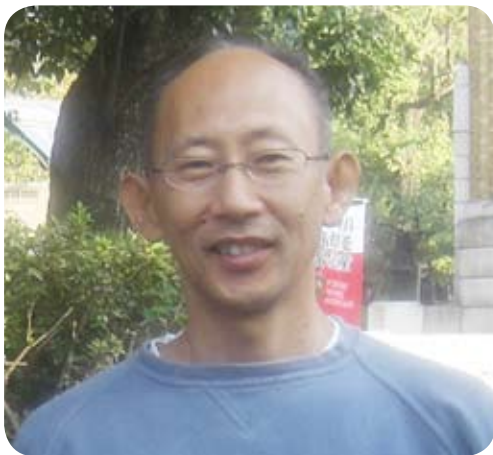
By Elmer Nakao Pearl Church/ Tengen Branch Church

The typical first stage in an individual's journey of faith is learning about God and how man was created. Depending on the religion and a person's background, many do not get past this critical point as they become skeptical about God's existence and become atheists or choose to lead their lives without any thought of religion. Further stages for those that progress include: 2) believing in God, 3) understanding creation and God's intentions, 4) learning (and then wanting to learn) as much as possible about faith, beliefs, and practices, 5) living and